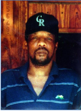
May 2, 1949–June 7, 1998

James Byrd, Jr. was born in Beaumont, Texas, one of nine children, to Stella and James Byrd, Sr. In 1967, Byrd, who was African-American, graduated from the last segregated class at Jasper's Rowe High School. Byrd went on to marry and have three children.